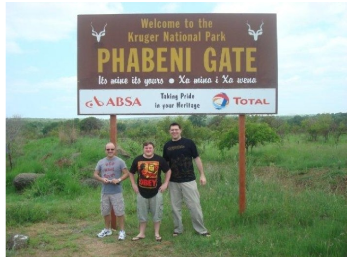
Compass Chef of the Year Winners visit the Kruger Park

This trip not only gave the Chef's a better understanding of Macadamia Nuts and the South African Market, but also went a long way in establishing future relationships for the industry abroad.